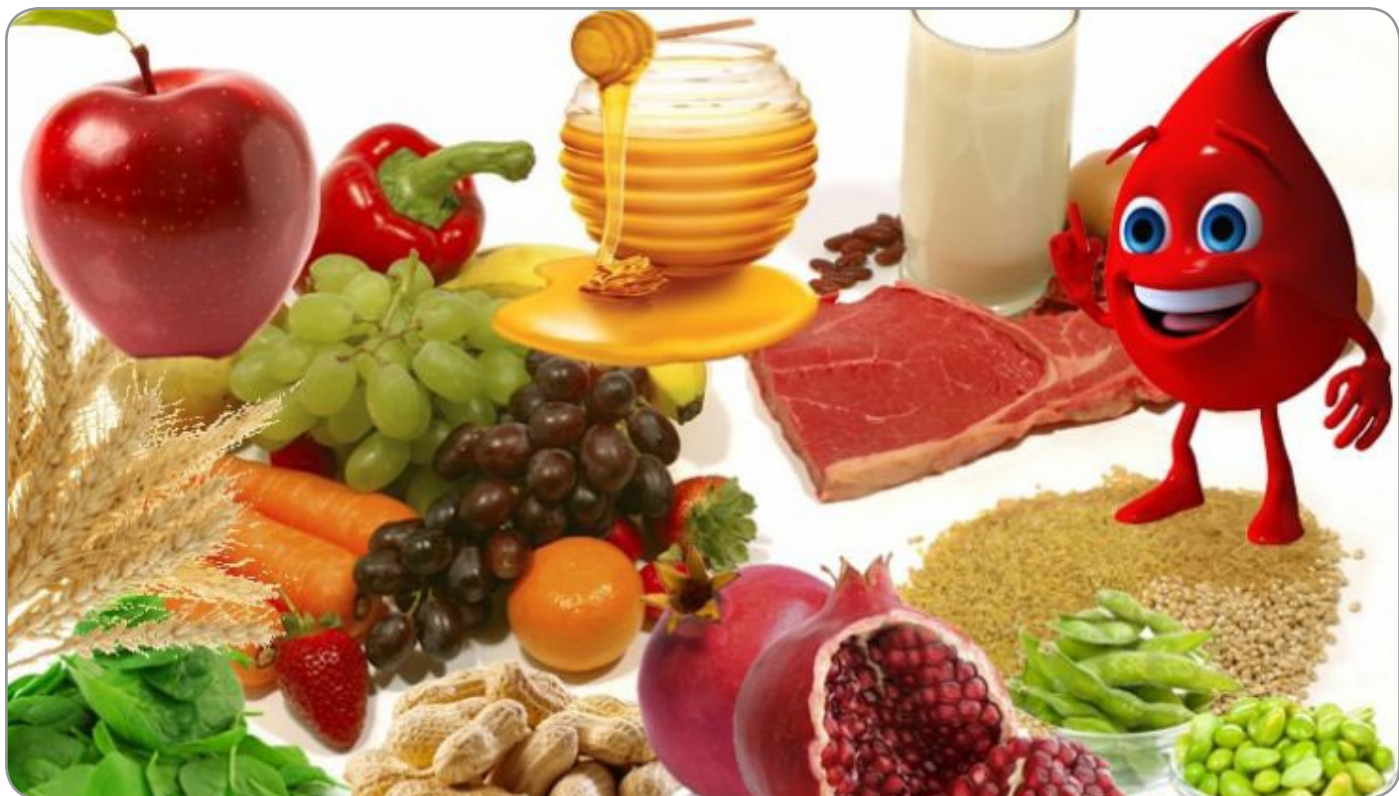
Figure 2: Super Foods to Combat Anaemia. The above diagram shows examples of foods that can be taken to prevent iron deficiency anaemia.